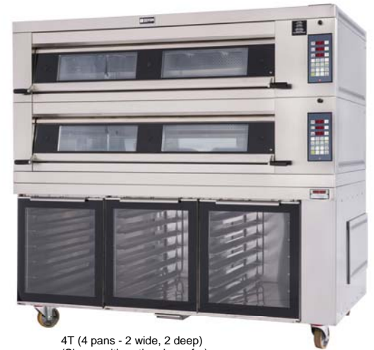
4T (4 pans - 2 wide, 2 deep) (Shown with optional proofer)