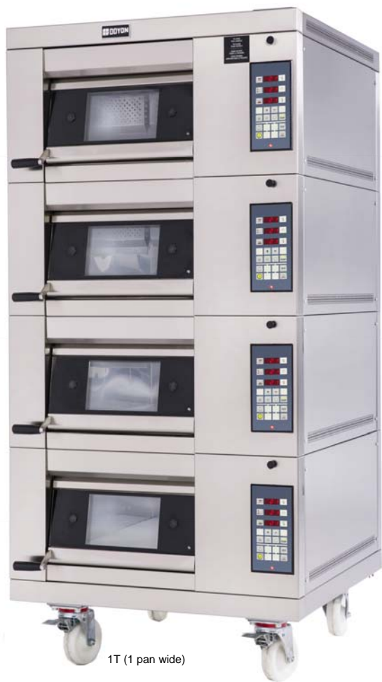
1T (1 pan wide)